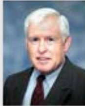
Richard W. Mies Admiral US Navy (Retired)